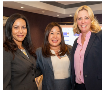
2023 MCLE Luncheon on Ethics & Civility