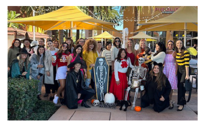
Annual "Coffee & Costumes" Meetup October 2023

Holiday Celebration & Installation Dinner December 2023